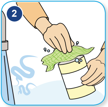
Wash the top of the can or plastic formula container with hot water and soap.

Have all your sterile feeding equipment ready (See Tip Sheet #2).