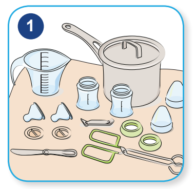
Wash hands and counter with soap and water.

For information on making an informed decision on how to feed your baby talk to your health care provider or public health nurse. See <u>Tip Sheet #1</u> for important facts.