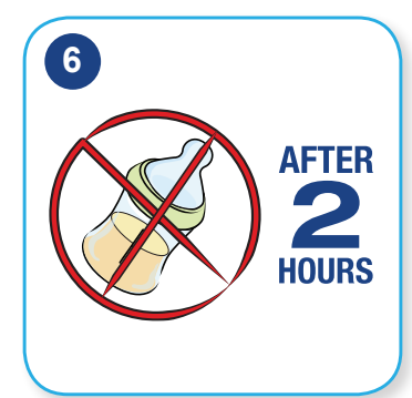
Feed your baby in response to baby's feeding cues (See Tip Sheet #6).

Throw out formula that your baby doesn't drink after 2 hours.