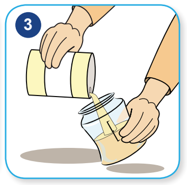
Pour the formula directly into a clean and sterilized bottle.

Shake the can well and open with a sterilized can opener.