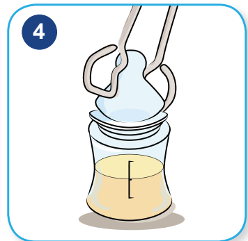
Pick up nipple, cap, and ring with sterilized tongs and put on bottle.

Do not add water to ready-to-feed formula.