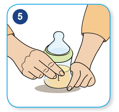
Tighten the ring with your hands.